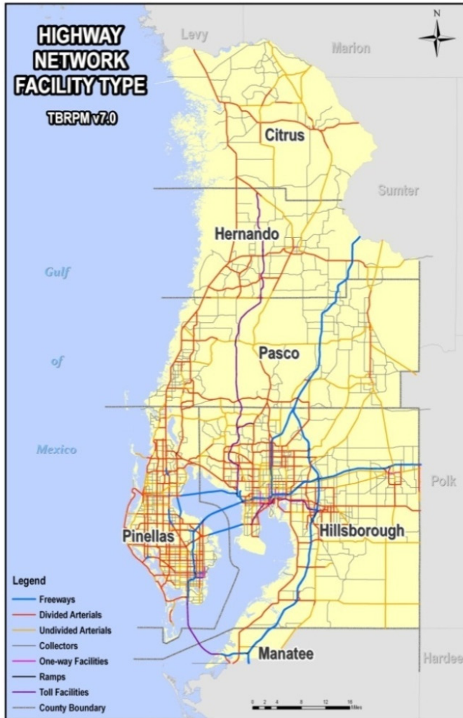
Exhibit 1: TBRPM v7.0 Model Network

The TBRPM v7.0 model and installation instructions are available at the RTA website ( http://www.tbrta.com/downloads.aspx ). The TBRPM download page is shown as Exhibit 2. The TBRPM documentation, including the validation report and procedural guide, will be provided at this site when released.